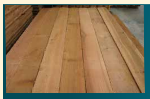
Viking Fence Residential Grade