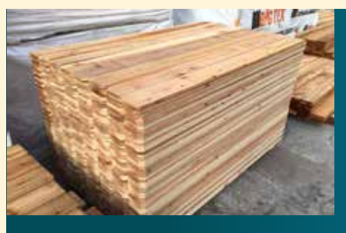
Viking Fence Import Island Cedar