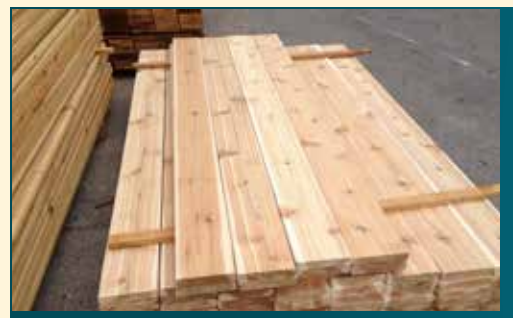
Viking Fence Select Board